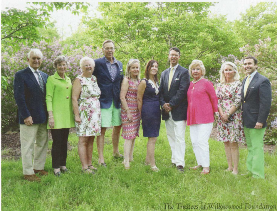
The Trustees of Willowwood Foundation